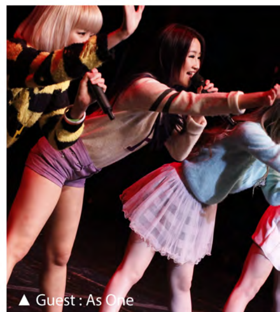
▲ Guest : As One