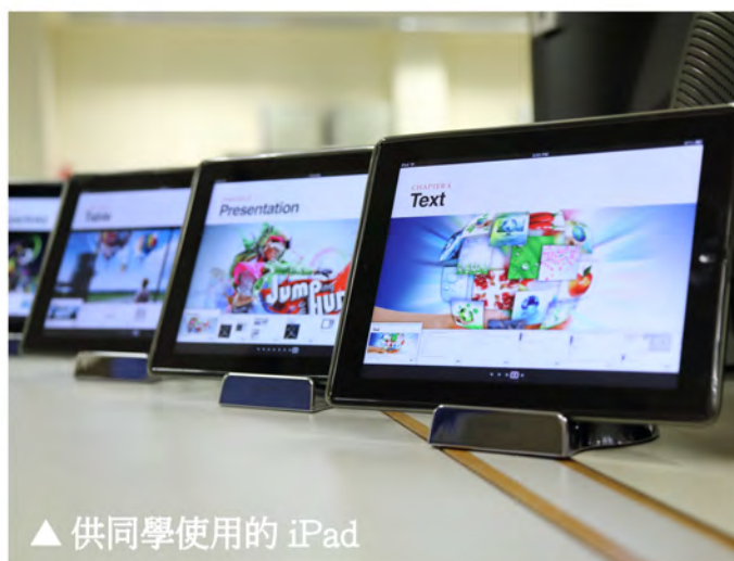
▲ 供同學使用的 iPad